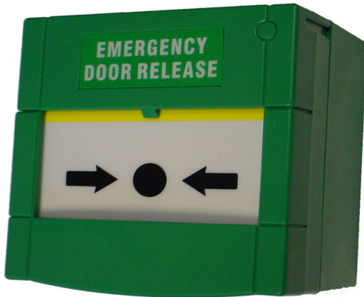
MCP22 Call Point Resettable Switch