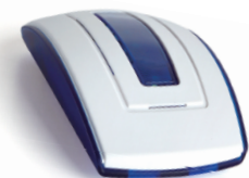
DOL-96 Mini Siren