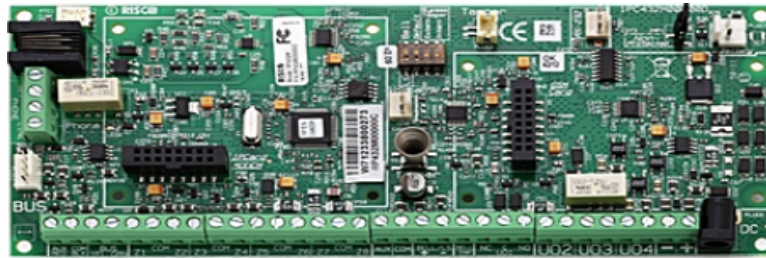
RISCO LightSYS 2 Controller