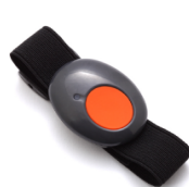
Wristband Panic Transmitter