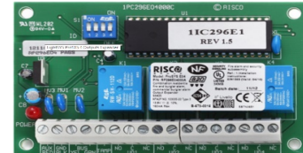
4 x 3Amp Relay Module