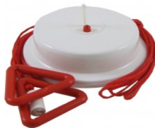
S1600-R Wall / Ceiling Pull Cord