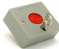
B-117 Panic Button with Key Reset