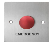
IP65 Metal Panic Button