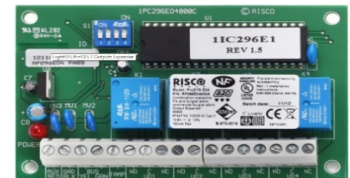
4 x 3Amp Relay Module