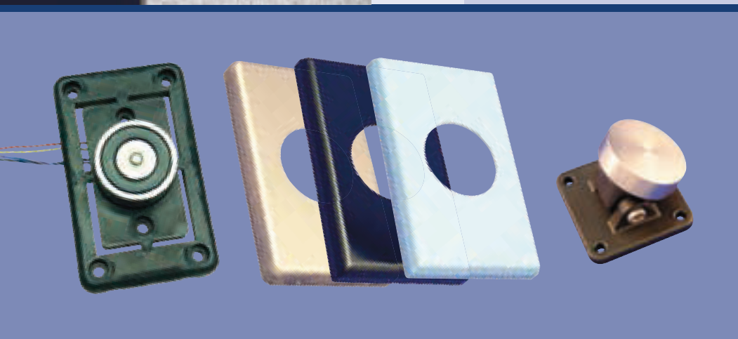
Satin Aluminium Gloss Black Gloss White