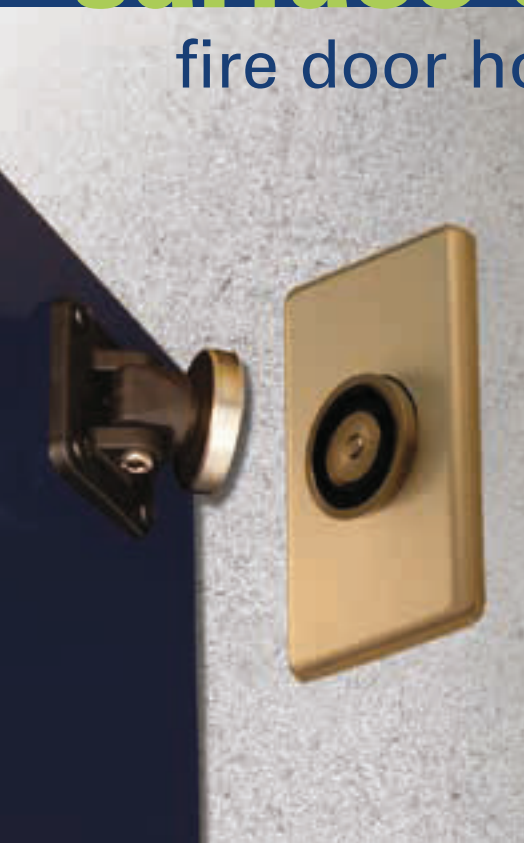
Option A – Surface Mounted Wall to door distance: 73mm

fire door holding electromagnets 12 & 24 VDC selectable